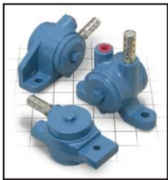
Ring vibrators are also available in Northern blue.

For the specifications on Ring Vibrators see our technical bulletin TB-NP-001a (Inch) or TB-NP-001b (Metric)